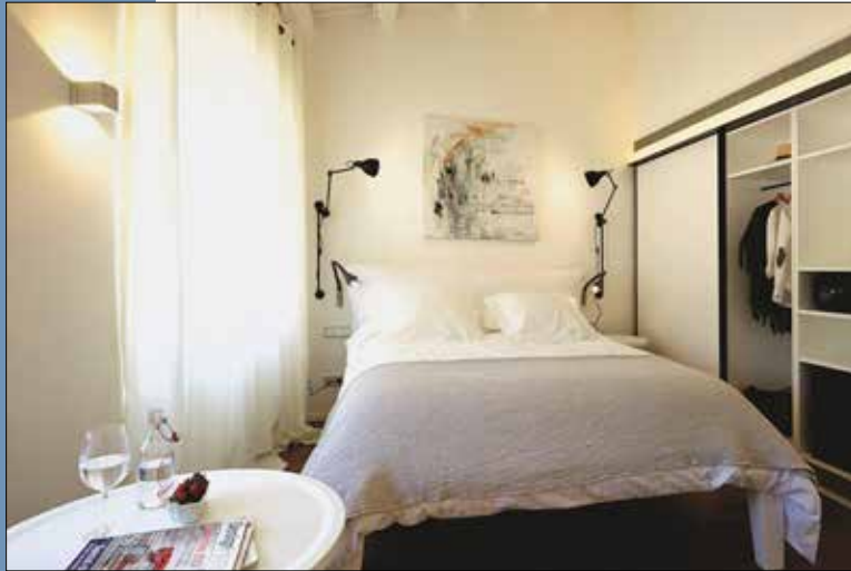
01 A Mas' room

Please, you do not hesitate to contact us for further information or to receive more complementary images.