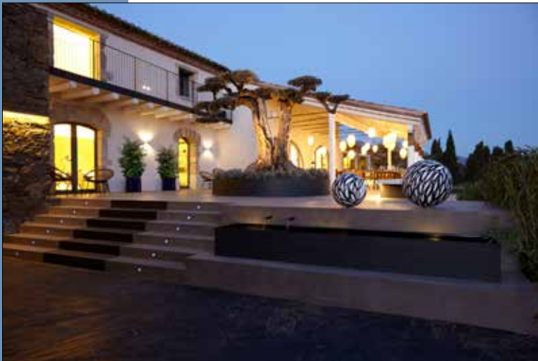
12 When the night falls, we can enjoy the spheres, from Carles Bros, and the olive tree with clouds' forms that frame the Mas Lazuli entrance