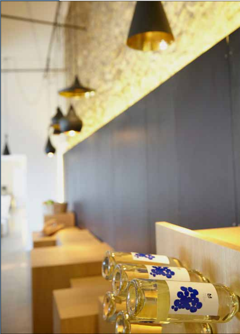
18 The Mas' wine