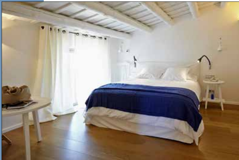
02 Room at the attic, which conserves elements from the ancient friary