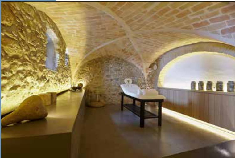
16 Wellness and spa room