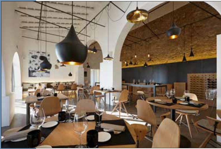
07 Inside the restaurant room