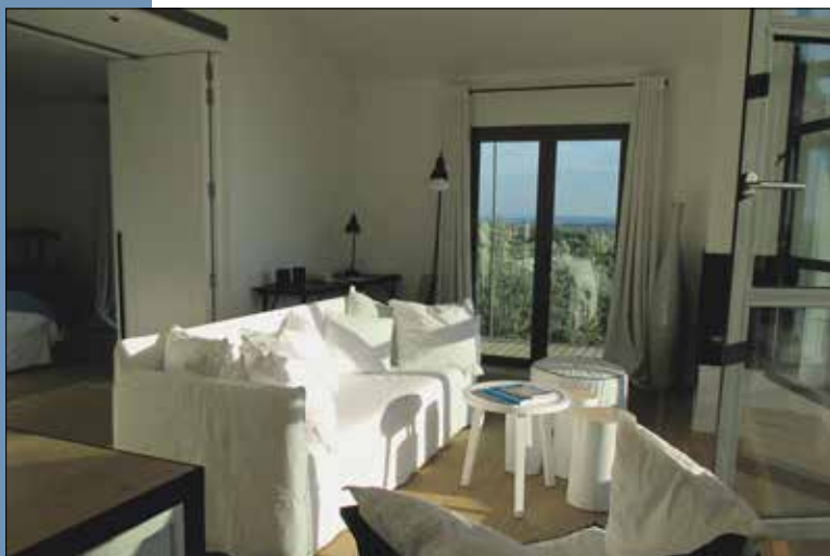
03 Apartment for 4 persons, with views on the fields and Empordà's landscapes