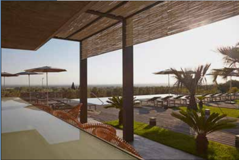
11 Views of the terrace, enjoying the Empordà