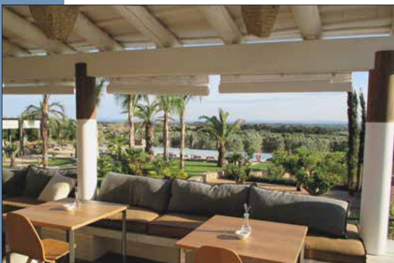
09 Terrace with views on the fields