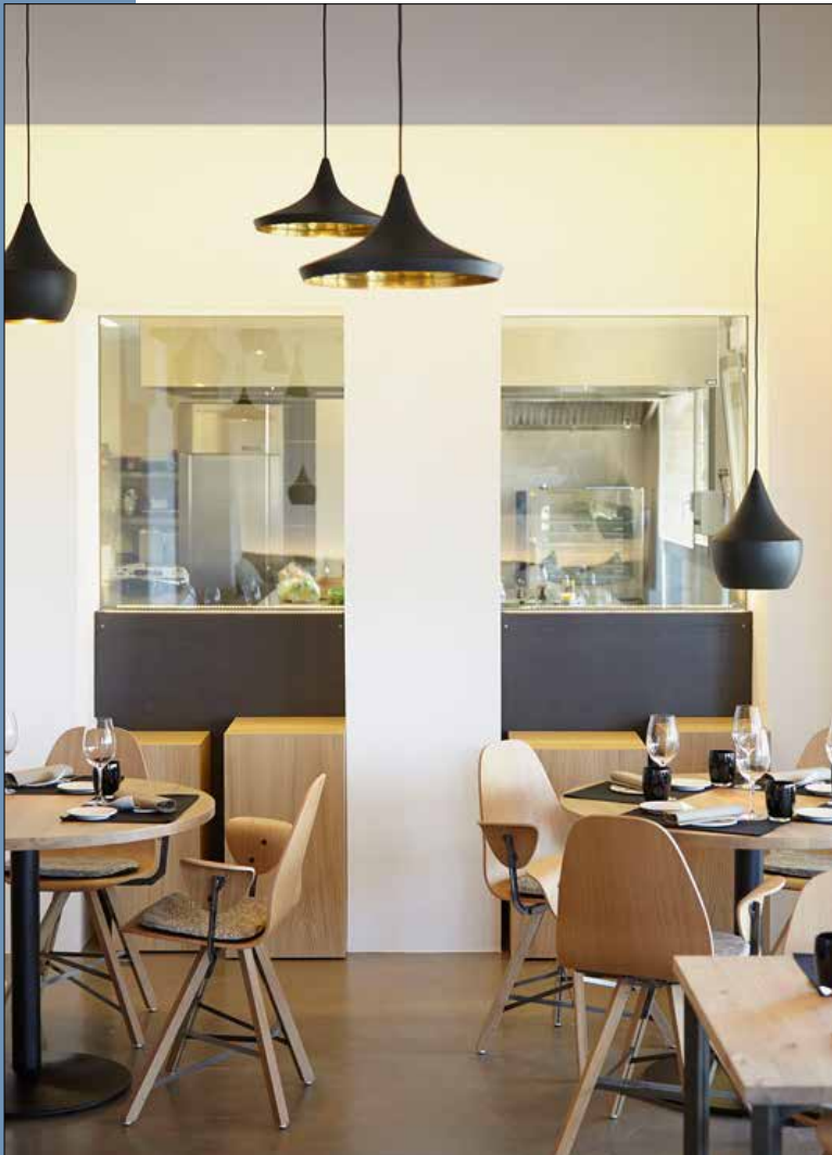
08 Views of the kitchen