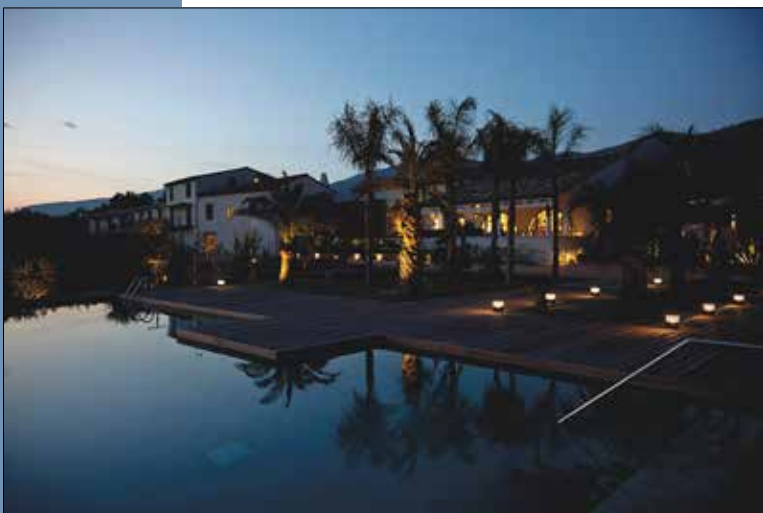
13 Views of Mas, from the swimming pool, at nightfall.